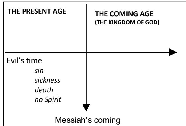
Figure 1. Jewish expectations in Jesus' day (figures from Fee's Paul, the Spirit, and the People of God )

blind see and the lame walk. Though most Jews did not accept Jesus as the Messiah, some did. In the years immediately after Jesus' resurrection, these followers of Jesus, all of whom were Jewish, had a problem. They proclaimed to all who would listen that Jesus truly was the long-expected Messiah, but it was also clear that evil and tragedy and suffering were still present in the world. Using Figure 1 as a guide, it's as if the Messiah had come, but the Kingdom of God had not! To the average Jew, the answer was simple – Jesus wasn't really the Messiah, hence the world still awaited the coming of the Kingdom of God.